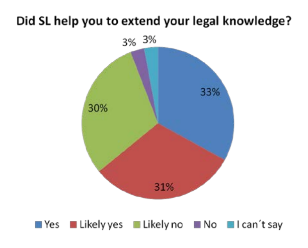
Graph n. 2: This graph reflects the results of the student point of view on extending their legal knowledge by Street Law.

Street Law is believed to be a powerful tool to deepen and extend the legal knowledge of law students. However, the number of respondents stating that Street law did not or did likely not help to develop their knowledge was surprisingly high (33%).