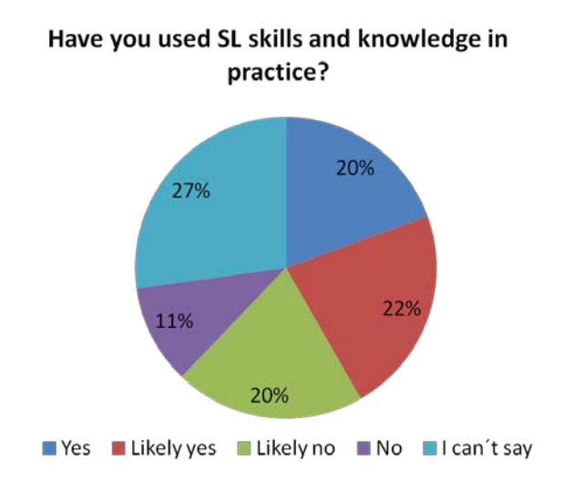
Graph n. 4.: Real use of Street Law benefits in legal practice.

And what were the situations respondents identified as examples of real use of Street Law skills in legal practice? The most frequent declared use of Street Law skills in practice was the communication of law to non-lawyers, especially clients in an