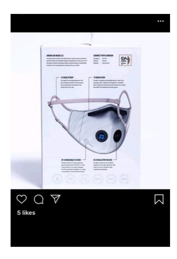
Figure 1. UGL supplier @goodtimesgear offering a one-off sale using Instagram's story feature in order to 'help out the community' at the beginning of the COVID-19 lockdown (08/04/20).